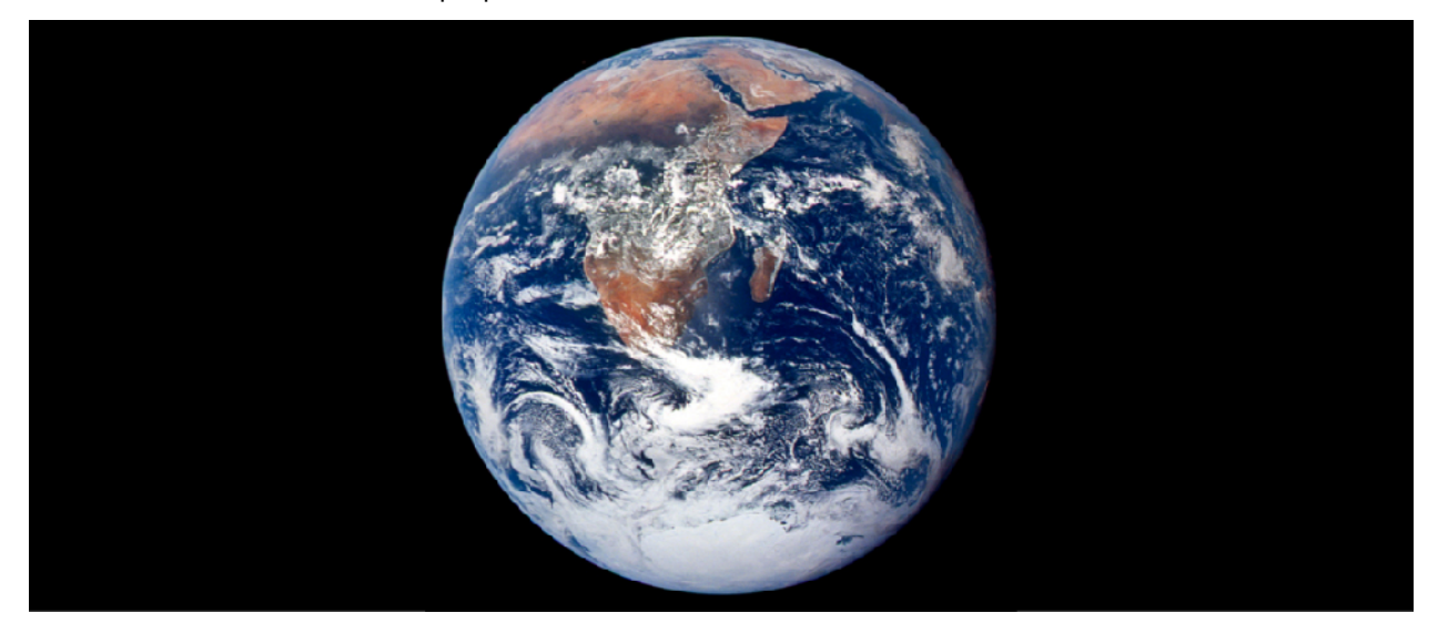
Figure 8.2 Blue Marble. This image of Earth from space, taken by the Apollo 17 astronauts, is known as the "Blue Marble." This is one of the rare images of a full Earth taken during the Apollo program; most images show only part of Earth's disk in sunlight.

Earth is a medium-size planet with a diameter of approximately 12,760 kilometers (Figure 8.2). As one of the inner or terrestrial planets, it is composed primarily of heavy elements such as iron, silicon, and oxygen—very different from the composition of the Sun and stars, which are dominated by the light elements hydrogen and helium. Earth's orbit is nearly circular, and Earth is warm enough to support liquid water on its surface. It is the only planet in our solar system that is neither too hot nor too cold, but "just right" for the development of life as we know it. Some of the basic properties of Earth are summarized in Table 8.1.