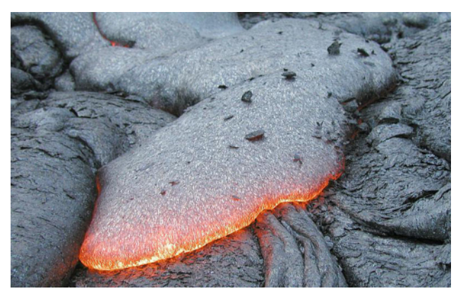
Figure 8.6 Formation of Igneous Rock as Liquid Lava Cools and Freezes. This is a lava flow from a basaltic eruption. Basaltic lava flows quickly and can move easily over distances of more than 20 kilometers.

Earth's crust is largely made up of oceanic basalt and continental granite. These are both igneous rock , the term used for any rock that has cooled from a molten state. All volcanically produced rock is igneous (Figure 8.6).