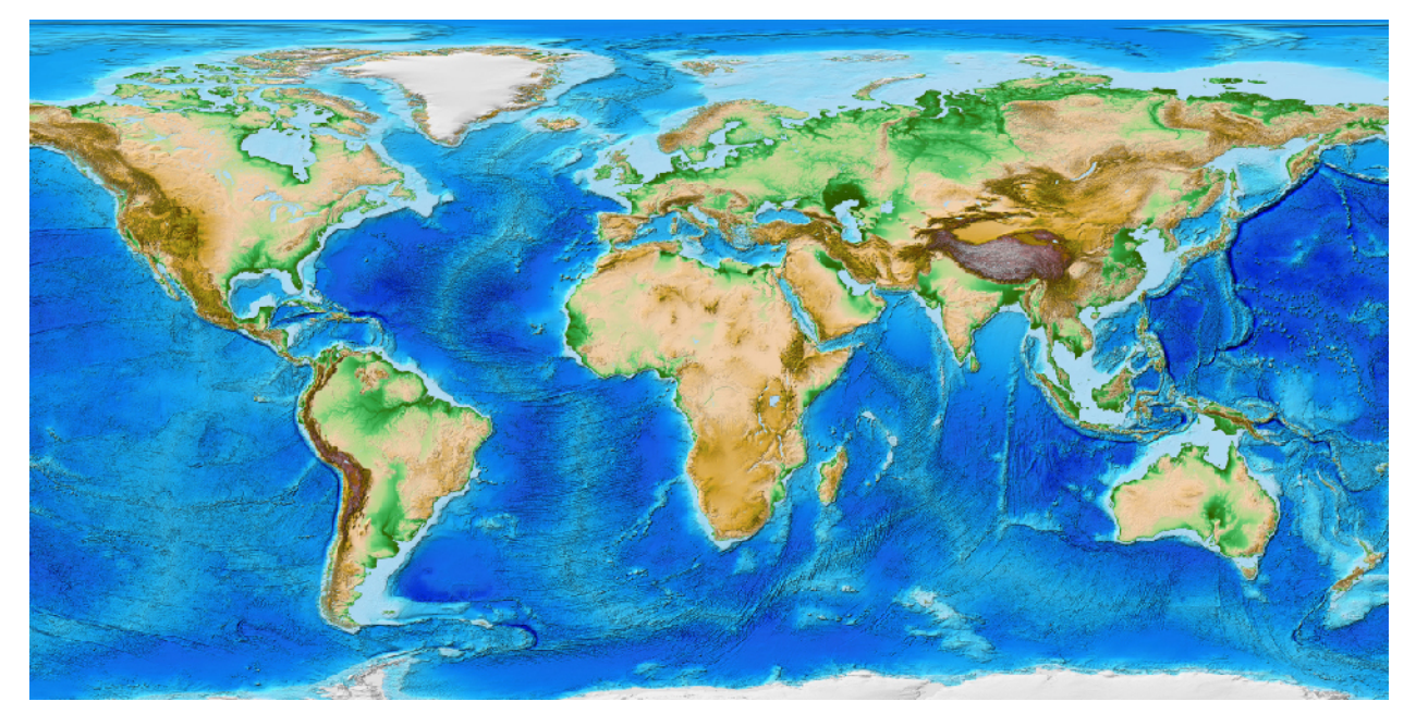
Figure 8.4 Earth's Crust. This computer-generated image shows the surface of Earth's crust as determined from satellite images and ocean floor radar mapping. Oceans and lakes are shown in blue, with darker areas representing depth. Dry land is shown in shades of green and brown, and the Greenland and Antarctic ice sheets are depicted in shades of white.

The top layer is the crust , the part of Earth we know best ( Figure 8.4 ). Oceanic crust covers 55% of Earth's surface and lies mostly submerged under the oceans. It is typically about 6 kilometers thick and is composed of volcanic rocks called basalt . Produced by the cooling of volcanic lava, basalts are made primarily of the elements silicon, oxygen, iron, aluminum, and magnesium. The continental crust covers 45% of the surface, some of which is also beneath the oceans. The continental crust is 20 to 70 kilometers thick and is composed predominantly of a different volcanic class of silicates (rocks made of silicon and oxygen) called granite . These crustal rocks, both oceanic and continental, typically have densities of about 3 g/cm<sup>3</sup>. (For comparison, the density of water is 1 g/cm<sup>3</sup>.) The crust is the easiest layer for geologists to study, but it makes up only about 0.3% of the total mass of Earth.